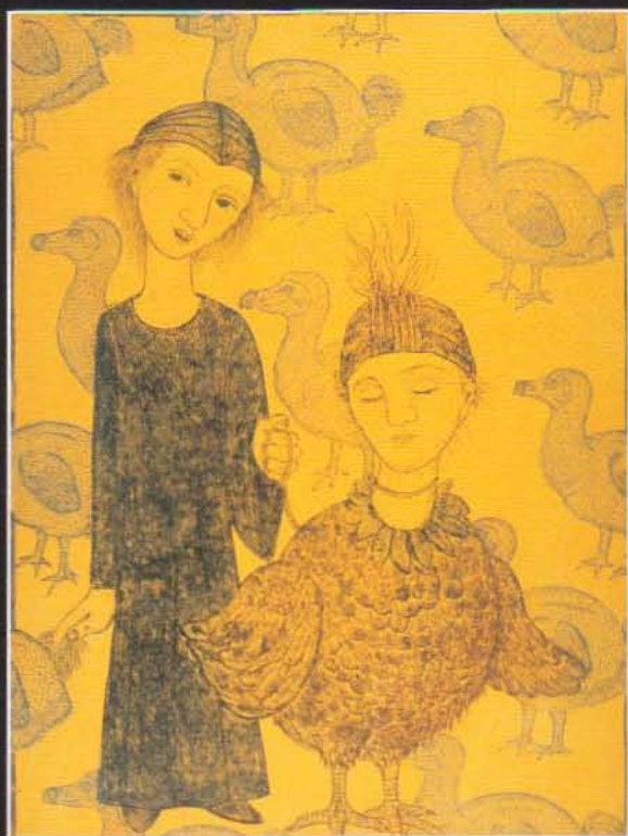
Bert Menco, Extinct , 1999