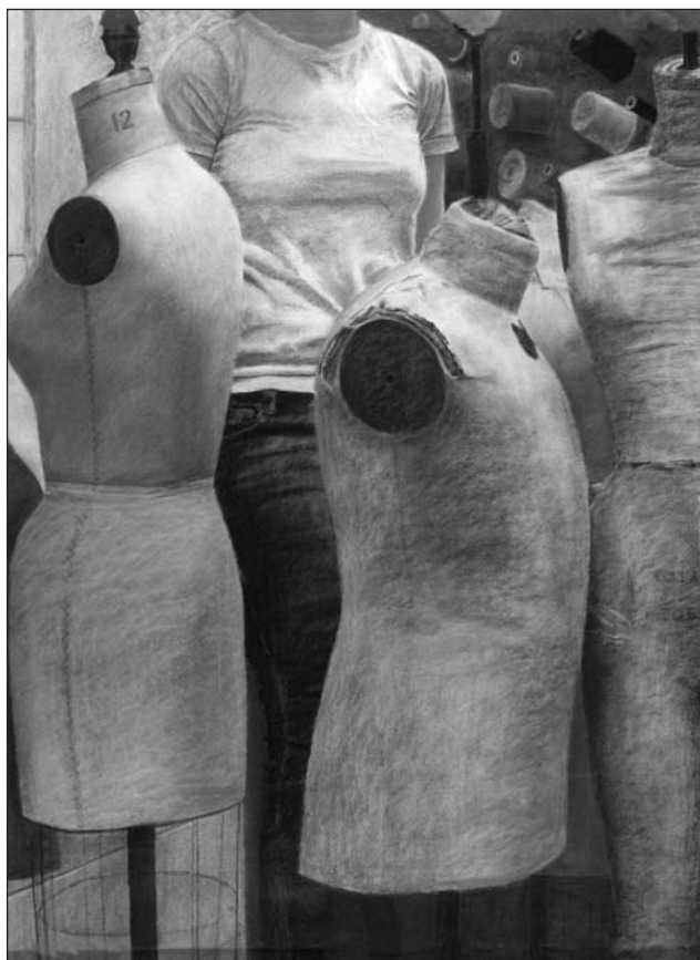
Cover Art: Siena Baldi, Object , 2008 Award of Excellence