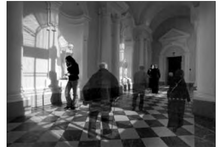
Cover Art: Lou Raizin, The Long Walk , Photography Recent Works 2007, Award of Excellence

(Attach these identification labels to the back of artwork in the upper left corner.)