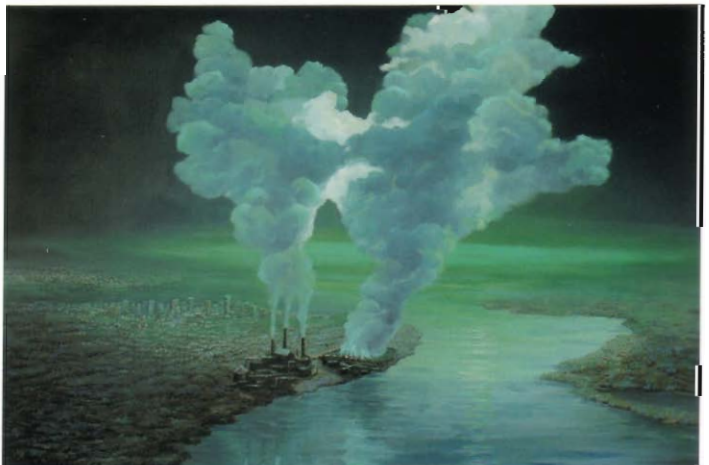
Yelena Klairmont, In Darkness is Light

In these paintings I am exploring a relationship between the rigid, geometric man-made patterns such as cultivated fields, deforested lands, urban developments, and industrial sites, all of which are an integral part of the contemporary landscape. These human constructs are juxtaposed against the patterns of organic forms and the untouched, seeming randomness of nature. Seen from above, one's awareness of earth's fragile mutability intensifies and a bittersweet awe sets in. Painting the landscape in a series at various seasons and times of day, I am recording the fundamental universal truth of change.