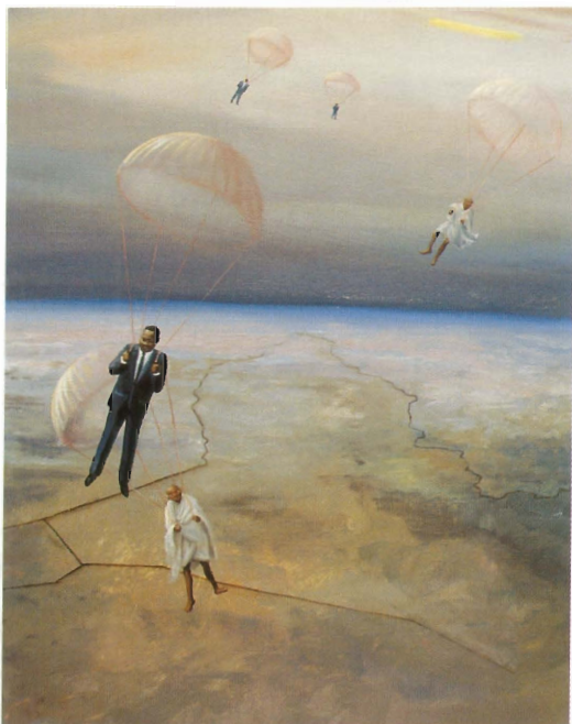
Renee McGinnis, A Force More Powerful (detail), 2003, oil on tabletop