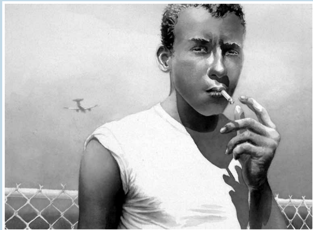
Guy Smoking, 2010 brush and ink on paper, 10 3/8" x 14"