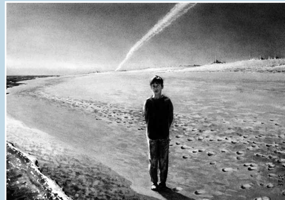
Footsteps and Vapor Trail , 2009 brush and ink on paper, 10 1/4" x 14 3/4"