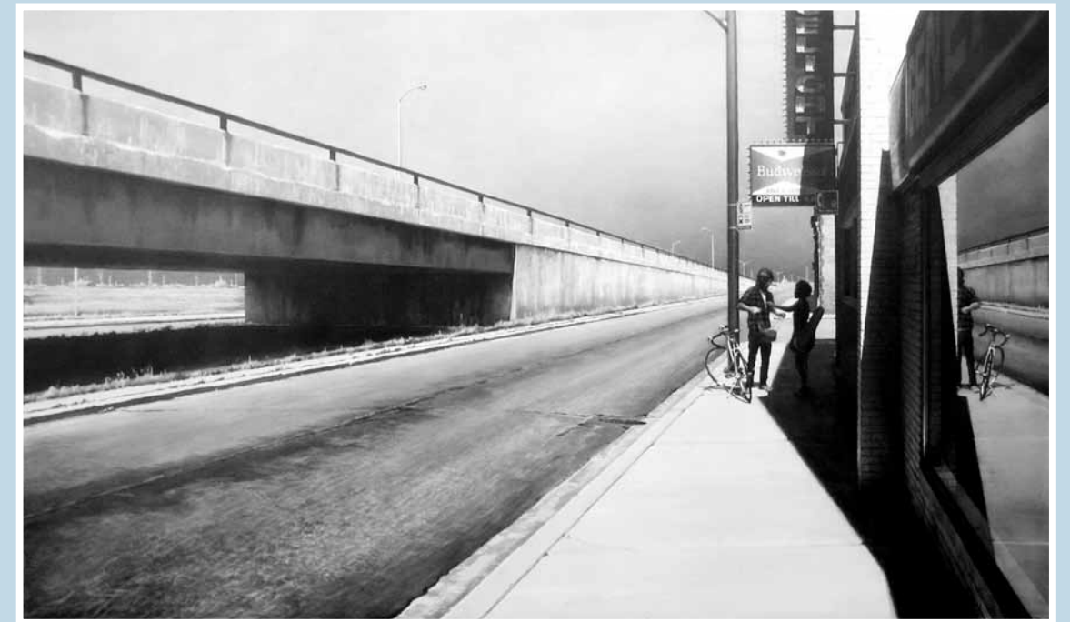
Blue Light , 2010, brush and ink on paper, 34 1/4" x 58"