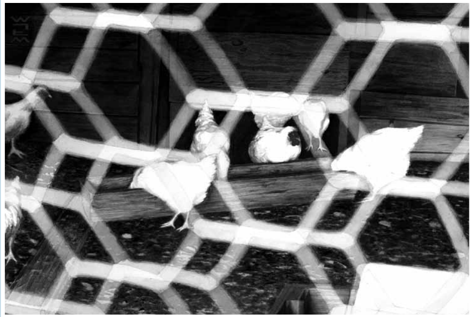
Chicken Pen, 2006 brush and ink on paper, 12" x 17 3/4"