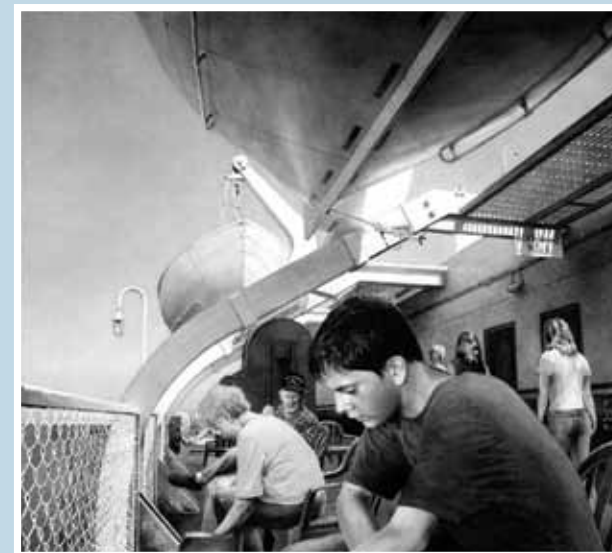
Ferryboat , 2009 brush and ink on paper, 16" x 18"