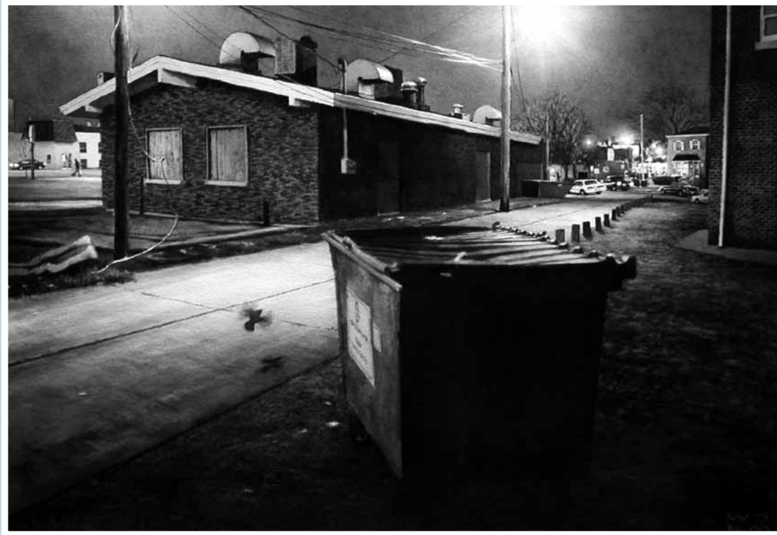
Migrating Bird , 2005 brush and ink on paper, 14 1/2" x 21"