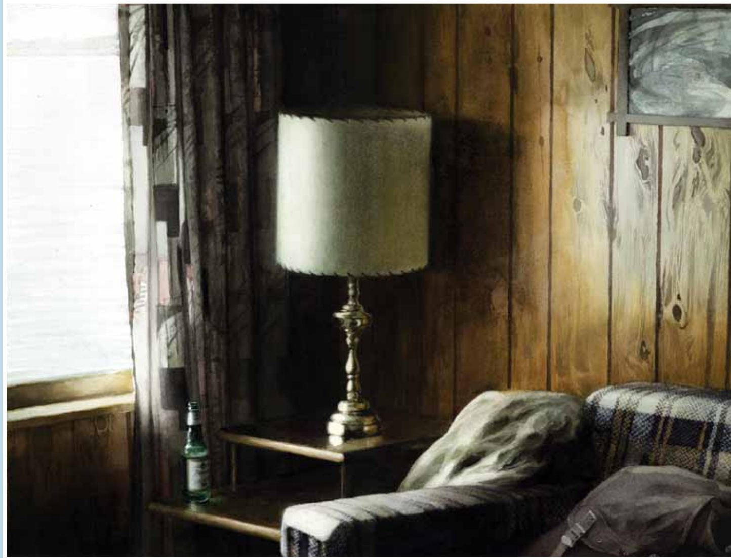
Lakeshore Motel , 2007, watercolor and ink, 15 1/2" x 20"