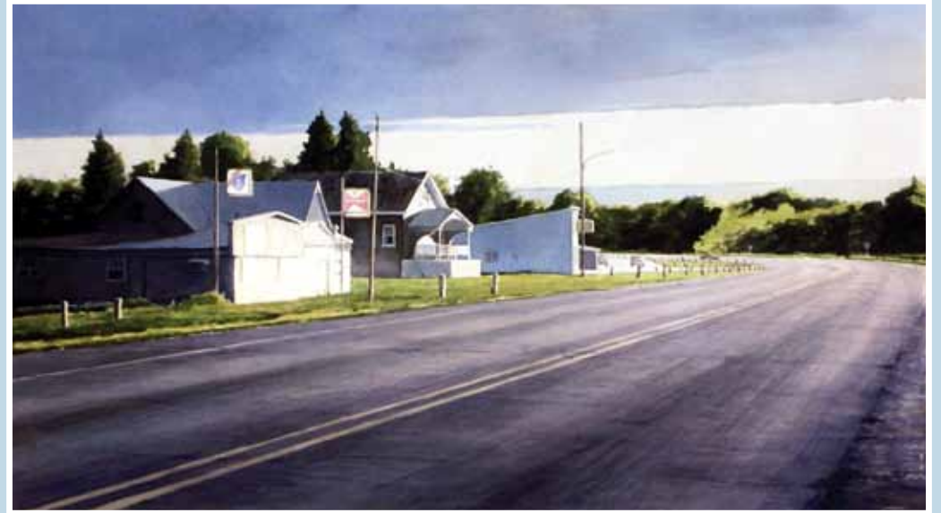
Road and Tavern, 2006 watercolor, 13 1/4" x 24"