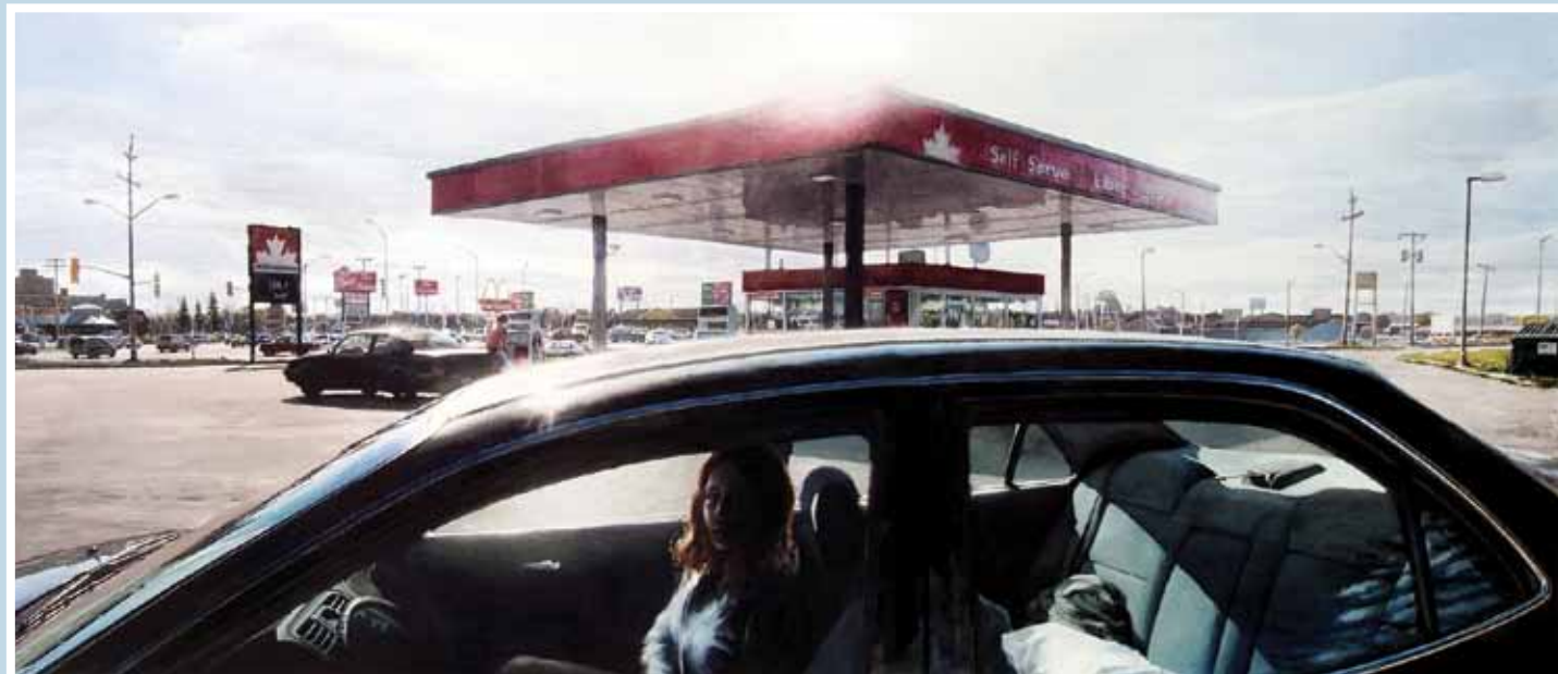
Petro-Canada , 2008, watercolor and ink, 16 1/2" x 38 1/2"