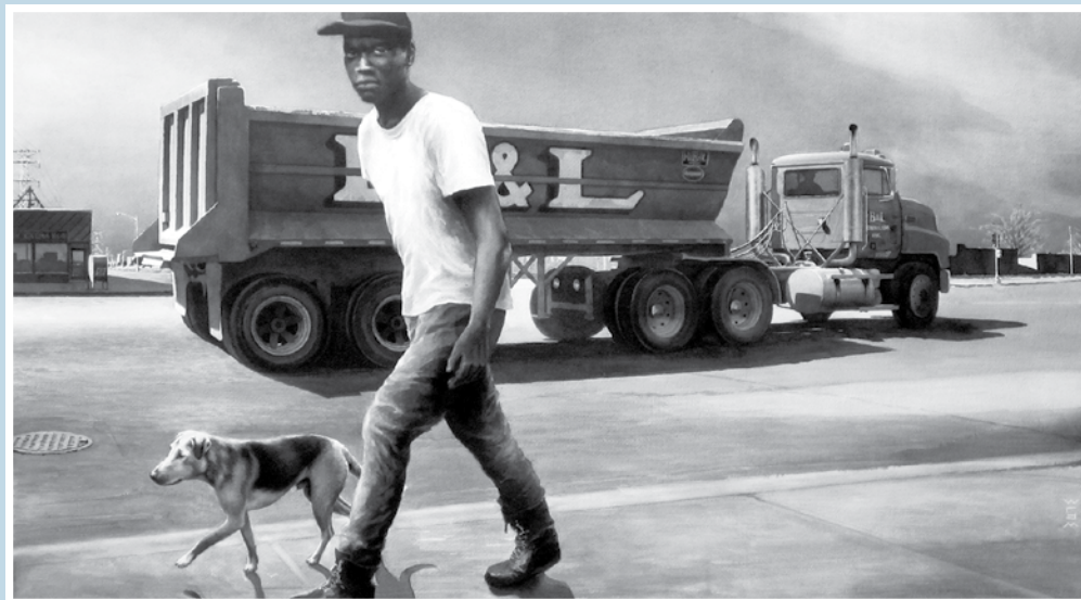
Dog/Man/Truck , 2010 brush and ink on paper, 19 1/4" x 34 1/2"